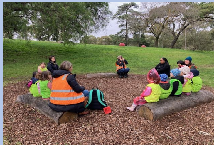
Lake Park Kindergartens Nature Play Program, where children experience a connection to the land they play on.

From September 26 2022, Moreland City Council will now be known as Merri-bek.